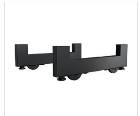
Optional lower leg kit for Corridor 8177 & 8179. Height of lower legs is 4.75 in | 12 cm, reducing overall height by 3.75 in | 9.5 cm