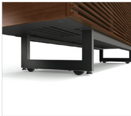
Hidden wheels allow the cabinet to be rolled away from the wall for easy access to the back of components