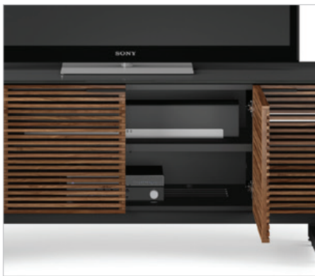
Center doors conceal an adjustable shelf for use with a speaker up to 38.1 in | 97 cm wide