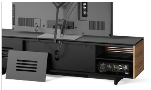
Removable back panels provide easy access to cables and connections