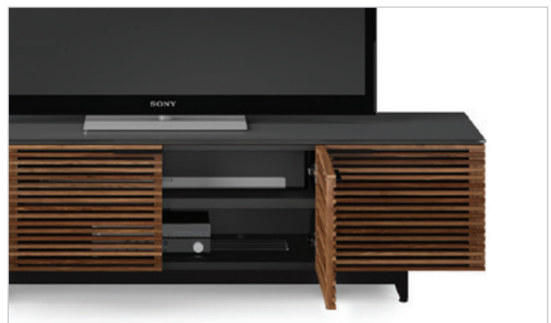
Center compartment accommodates a soundbar up to 38.1 in | 97 cm wide